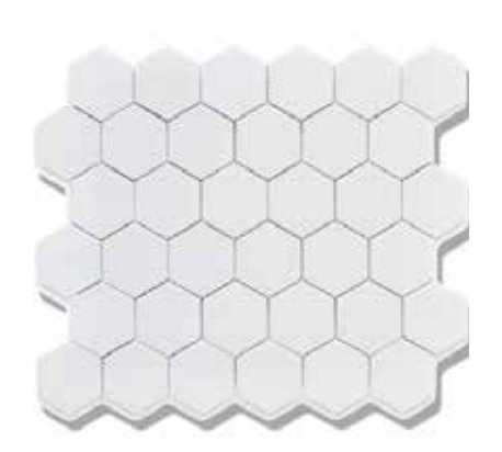
White Matte 2"x2" Hexagon 12"x12" Mosaic UFCC102-12MT