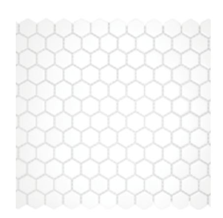
White Matte 1"x1" Hexagon 12"x12" Mosaic UFCC104-12MT