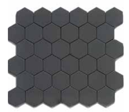
Black Matte 2"x2" Hexagon 12"x12" Mosaic UFCC103-12MT