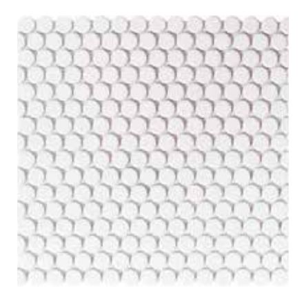
White Penny Round 12"x12" Mosaic Bright / UFCC108-12MT Matte / UFCC109-12MT